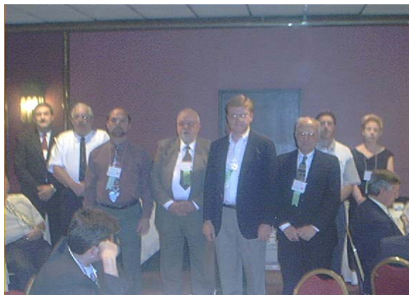
*PASE Officers for 2002-2003 are sworn in (right)